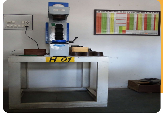
Hardness Testing Machine