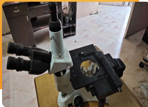
Micro Structure Testing Machine