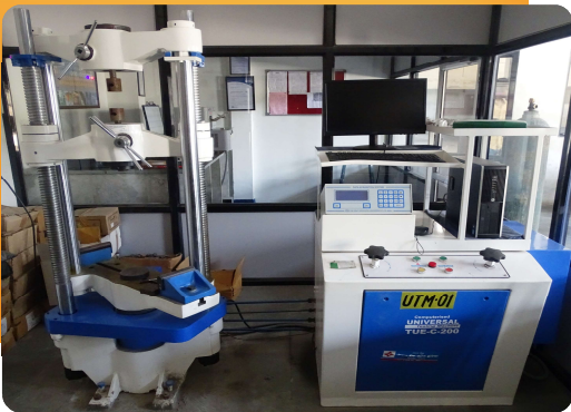
Universal Tensile Testing Machine