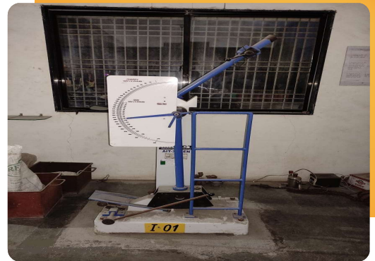
Impact Testing Machine